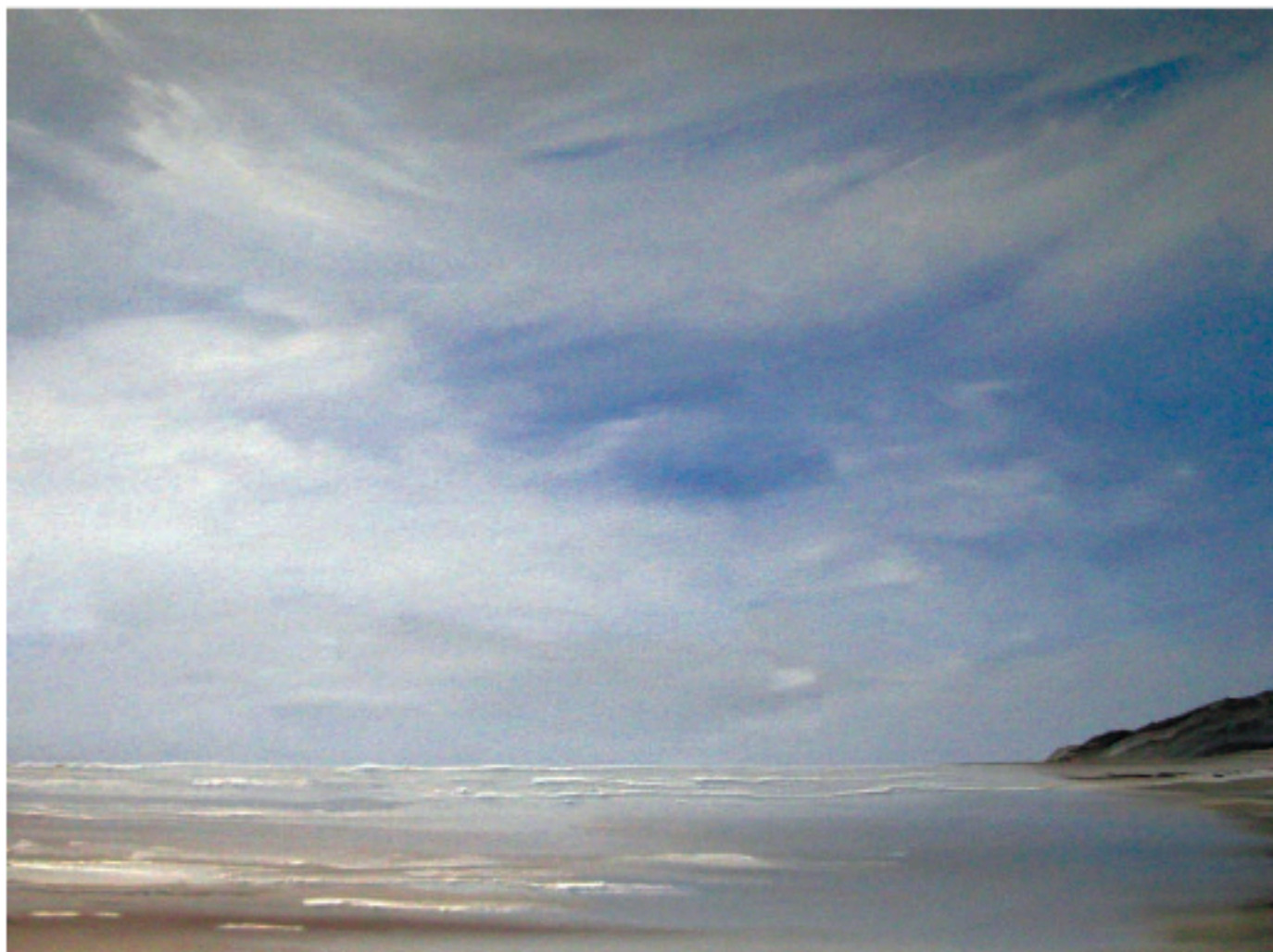
AFTER THE STORM, OIL ON CANVAS, 36 X 48"