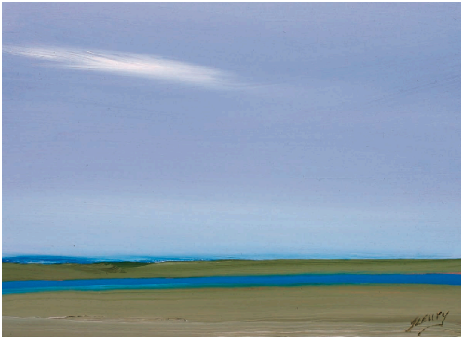
AZURE TIDE II, OIL ON COPPER, 5 X 7"

"Rick's sense of placement for the viewer is remarkable. He gives us great vistas with a mellow sense of our point of view. The viewer is taken in by the vast expanse of sea and sky. We are not lost in the view as much as we are a part of it. Rick relates the greatness of the sea and sky, light and land to us with pinpoint accuracy. He has the sense and ability to show us the greatness of Cape Cod."