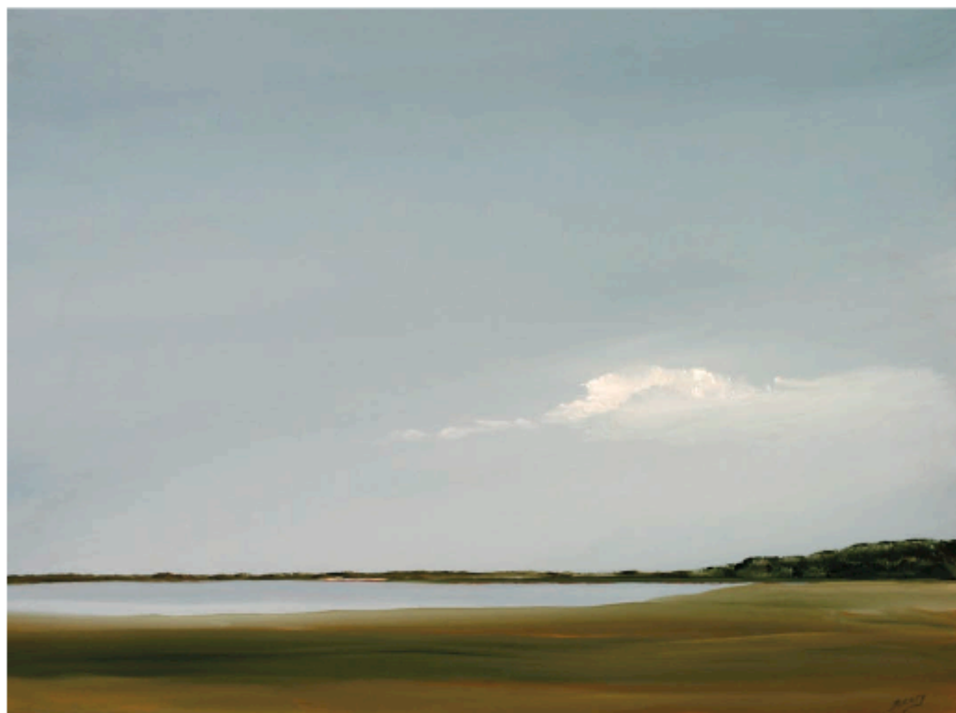
TOWARD TOWN, OIL ON COPPER, 18 X 21"

and as I'm working now, I'm still expanding my palette little by little," says Fleury. "I've been enjoying working with a limited palette and getting a lot out of a little palette with tonality. I think of it as adding treble and bass, pushing and pulling within the palette, experimenting and exploring with different colors and just reaching deeper."