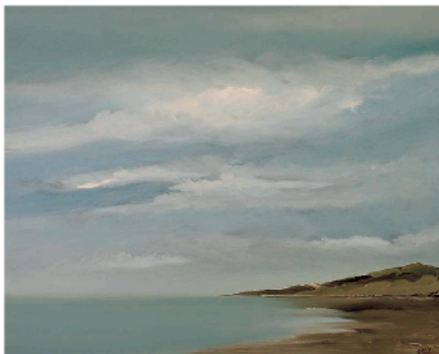
INFINITY, OIL ON COPPER, 14 X 18"