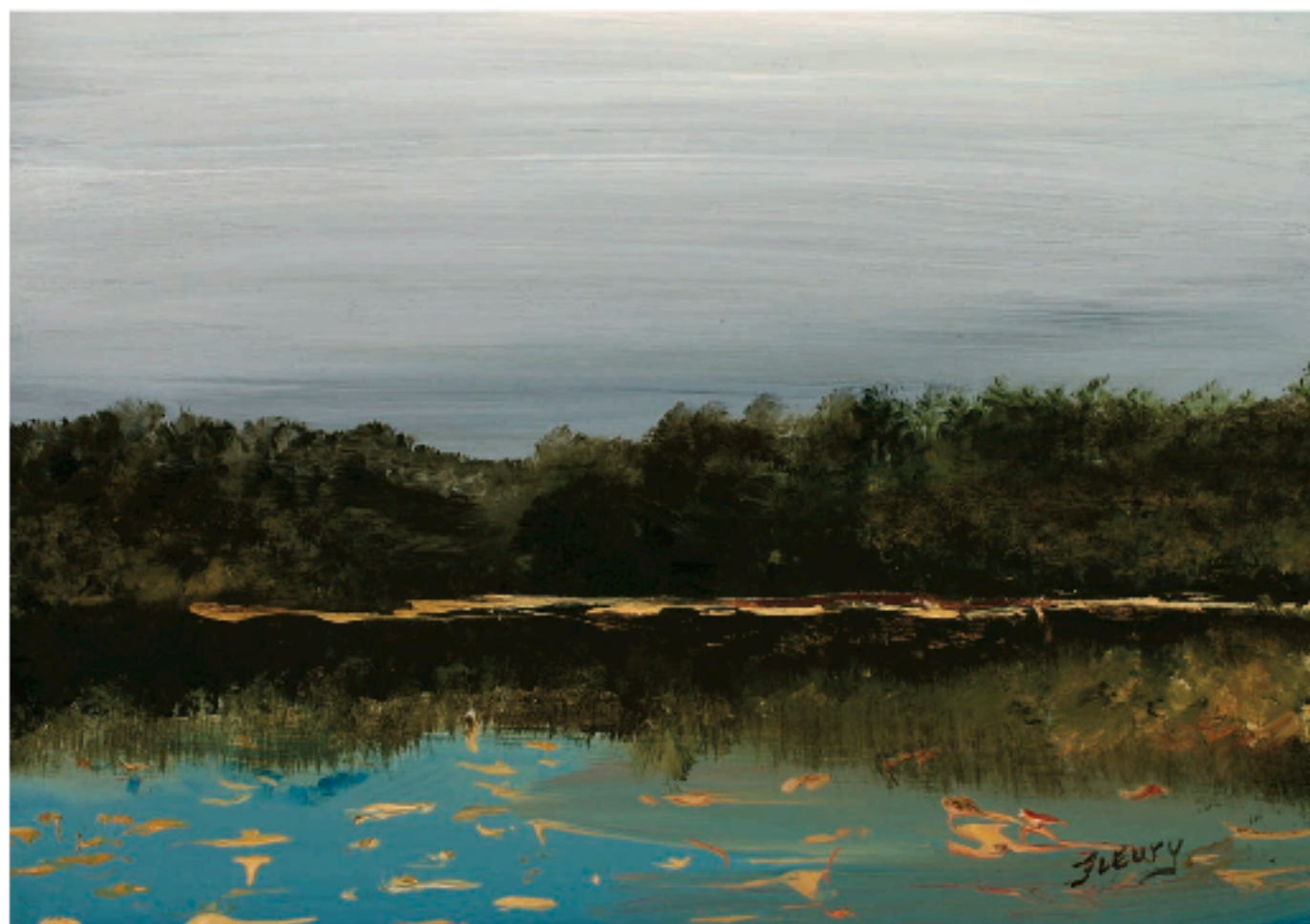
THE LILY POND, OIL ON COPPER, 5 X 7"

"I've definitely gained a broader brush stroke and have arrived at a stronger palette,