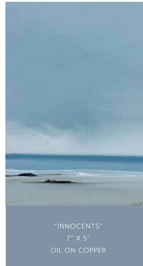
"INNOCENTS" 7" X 5" OIL ON COPPER