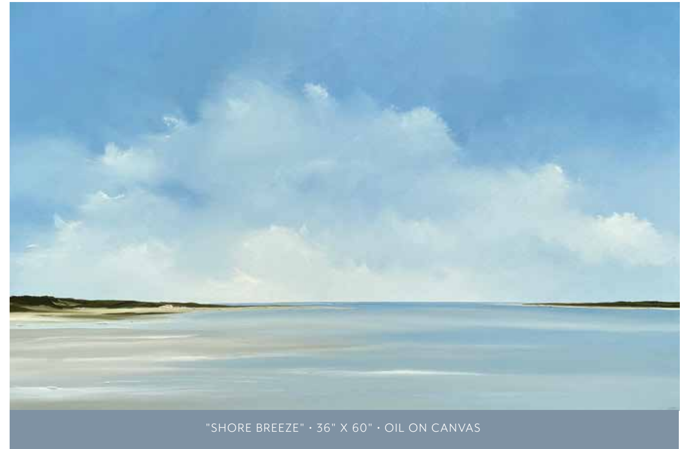
"SHORE BREEZE" • 36" X 60" • OIL ON CANVAS