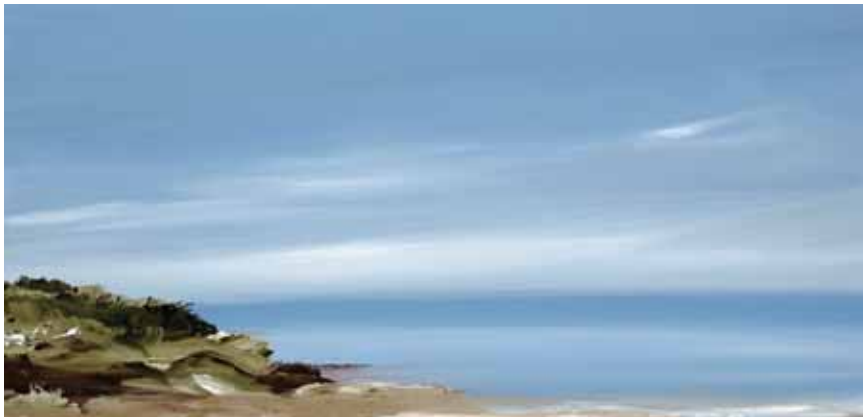
Mystic , Oil on Copper