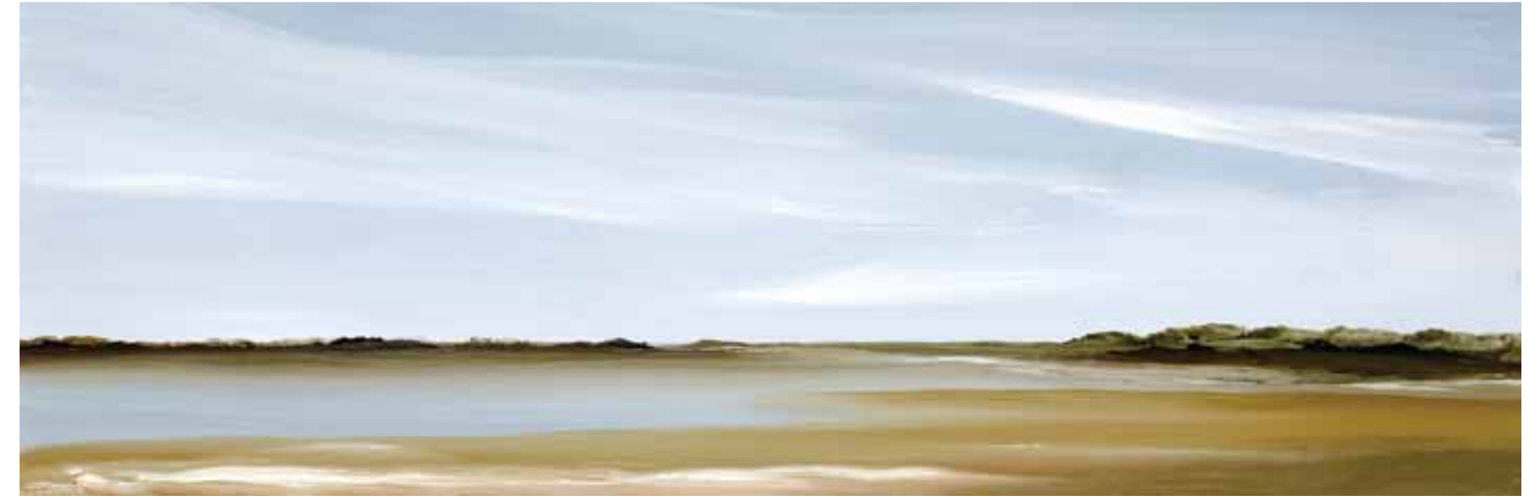
Regard, Oil on Copper