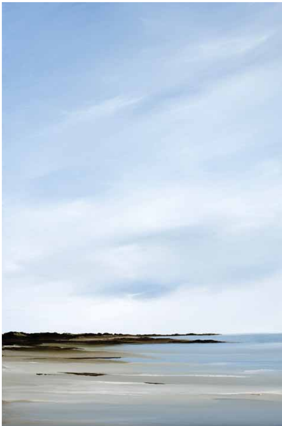
Aspect, Oil on Canvas